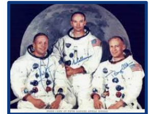
Buzz Aldrin, Neil Armstrong, Michael Collins.