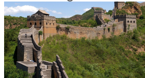
Great Wall of china